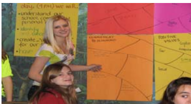
Williston Central School student facilitator, helps build their Asset Web during the analysis retreat.

This newsletter tells the story of the work of the 2009-2010 school sites: Hazen Union High School, Windsor High School, Ottauquechee Community Partnership, and Williston Central School (the first middle school engaged in this effort).