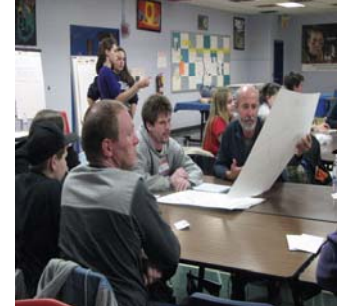
YRBS Dialogue Night