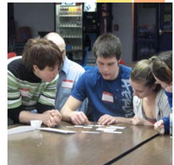
Opening Dialogue Night Activity: The Data Matching Game